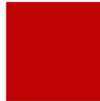
Laser Red solid