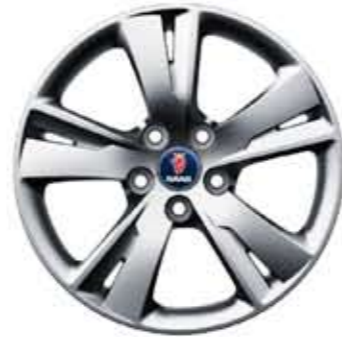
Alloy wheel 5-spoke Carve 18×8" (ALU 102)