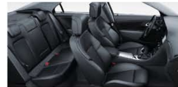
Leather ventilated sport seats. Jet Black upholstery. Jet Black cabin. Jet Black door inserts. (Optional)