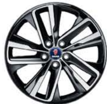
Alloy wheel 10-spoke Edge Glossy Black 19×8½" (Accessory)