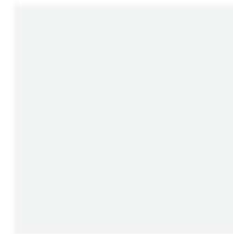
Arctic White solid