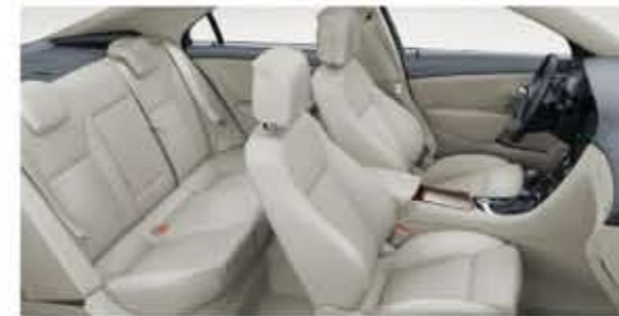
Leather comfort seats. Parchment upholstery. Dark Cocoa/Parchment cabin. Parchment door inserts. (Optional)