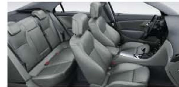
Leather/textile comfort seats. Shark Grey upholstery. Jet Black/Shark Grey cabin. Shark Grey door inserts. (Vector)