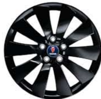
Alloy wheel 10-spoke Turbine Black 19×8½" (Accessory)