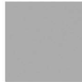
Diamond Silver metallic