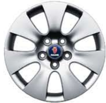
Alloy wheel 7-spoke Core 17×7" (ALU 101)