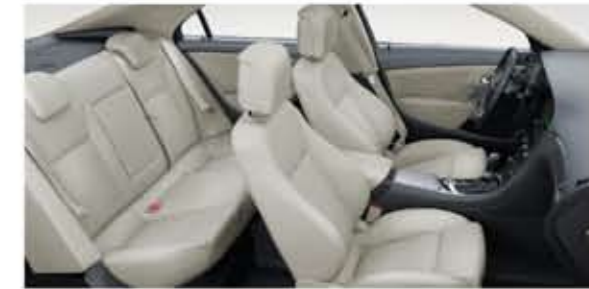
Leather comfort seats. Parchment upholstery. Jet Black cabin. Parchment door inserts. (Optional)