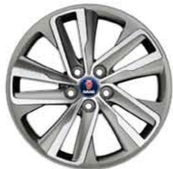
Alloy wheel 10-spoke Edge Silver 19×8½" (Accessory)