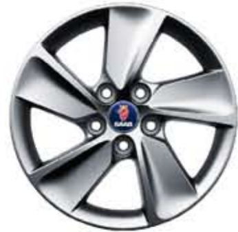
Alloy wheel 5-spoke Blade 17×7" (ALU 100)