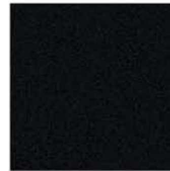
Carbon Grey metallic