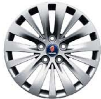
Alloy wheel 15-spoke Rotor 18×8" (ALU 103)