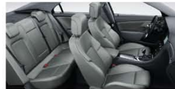
Leather perforated sport seats. Shark Grey upholstery. Jet Black cabin. Shark Grey door inserts. (Aero)