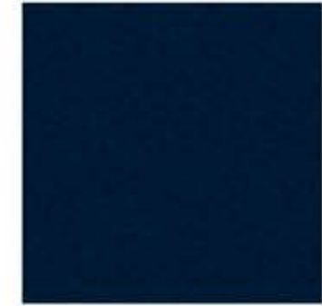
Fjord Blue metallic