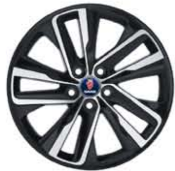
Alloy wheel 10-spoke Edge 19×8½" (ALU 104)