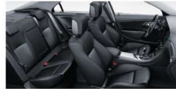
Woven textile comfort seats. Jet Black upholstery. Jet Black cabin. Jet Black door inserts. (Linear)