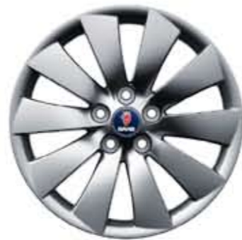
Alloy wheel 10-spoke Turbine 19×8½" (ALU 105)